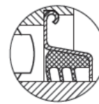
L 3 Triple-lip seal (Optional)